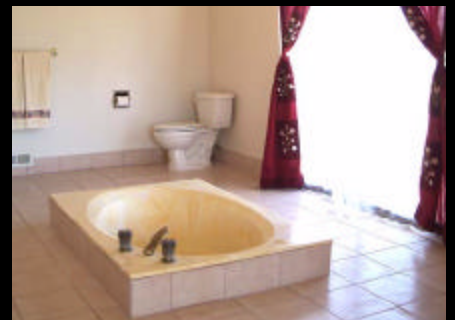
Romantic Master Bath